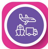
TRANSPORT & LOGISTICS