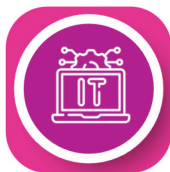
IT, SOFTWARE & COMPUTERS