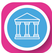
MUSEUMS & LIBRARIES