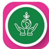
ENVIRONMENTAL CONSERVATION & MANAGEMENT