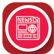
MEDIA & JOURNALISM