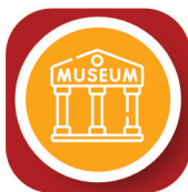
MUSEUMS & CULTURAL INSTITUTIONS