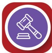
LAW & LEGAL SERVICES