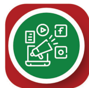
ADVERTISING & MARKETING