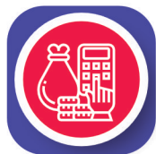
BUSINESS & FINANCE