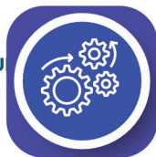
ENGINEERING & MANUFACTURING